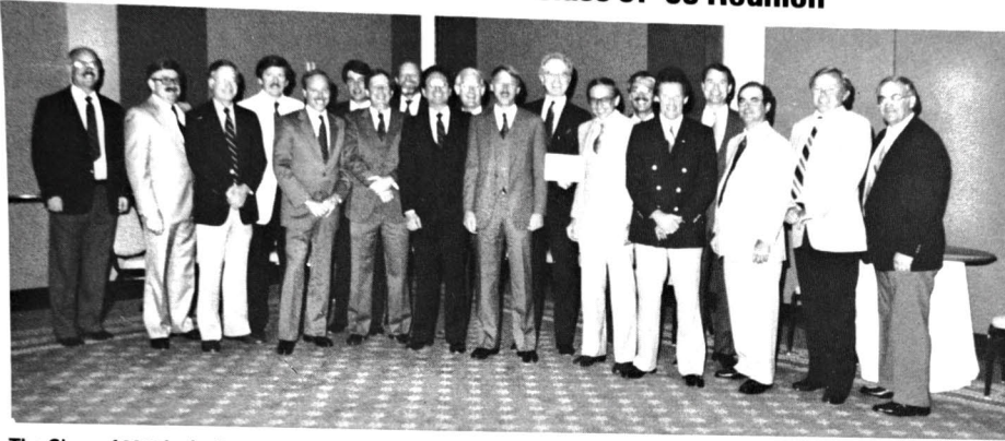
The Class of 1965 looked very dignified at the Alumni Dinner. The other pictures were taken at the more carefree get together around the pool at the Marvin Cohen home.