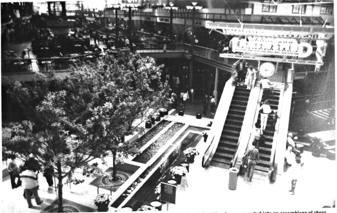
A view of the colorful interior of St. Louis Union Station. The great old railroad depot has been converted into an assemblage of shops and restaurants. The 1985 alumni annual meeting was held at the Omni International Hotel in Union Station.

Washington University School of Dental Medicine 4559 Scott St. Louis, Missouri 63110