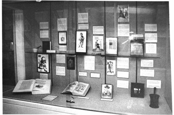
One of the showcases of dental school memorabilia on display at the Medical School Library.