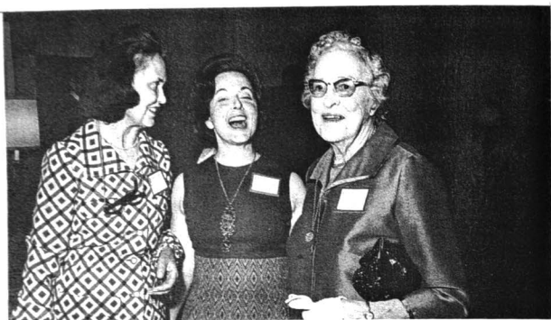
Century Club Cocktail Party