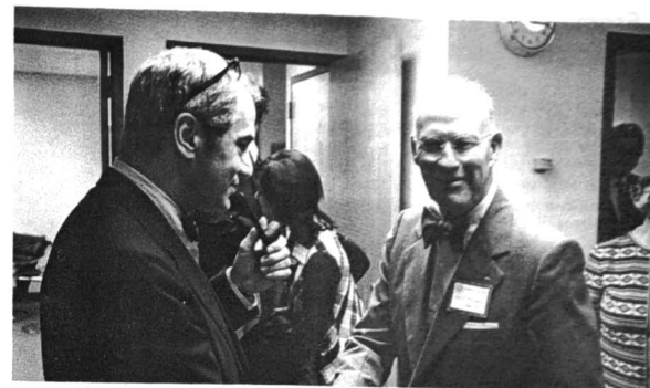
Open House at School