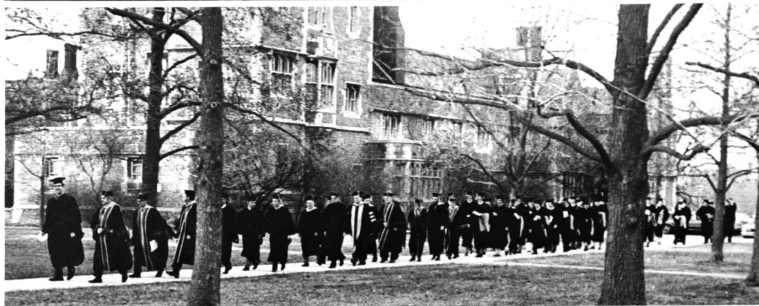
The academic procession wends its stately way across the Washington University campus toward Graham Memorial