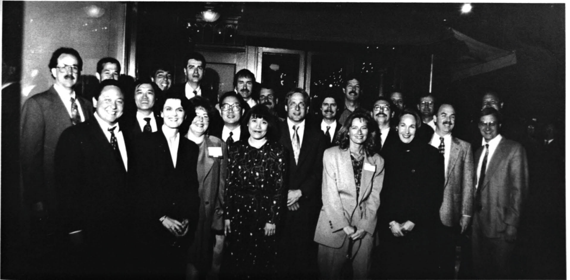
The Class of 1984 showed up with over 25 members to salute ten years out of school.