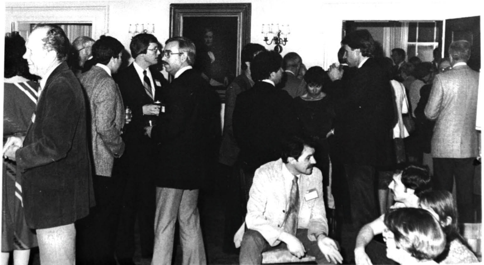
Good conversation filled the air as senior students and their spouses got acquainted with alumni and their spouses at the Century Club cocktail party, held each Spring at the University's Ellenwood Alumni House.