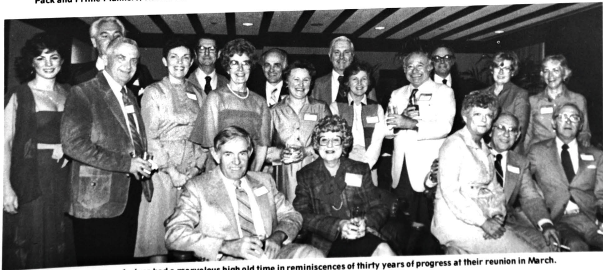
The class of 1951 and wives had a marvelous high old time in reminiscences of thirty years of progress at their reunion in March.