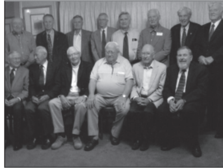
The Class of 1954 celebrates their 55th reunion.