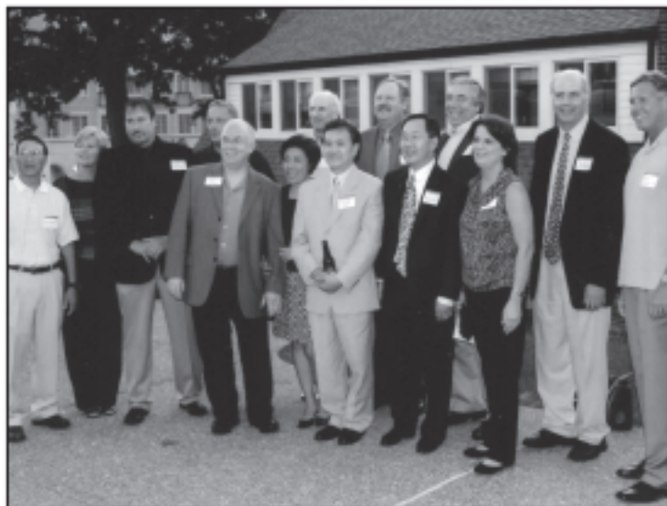
Class of 1984 enjoys their 25th reunion.