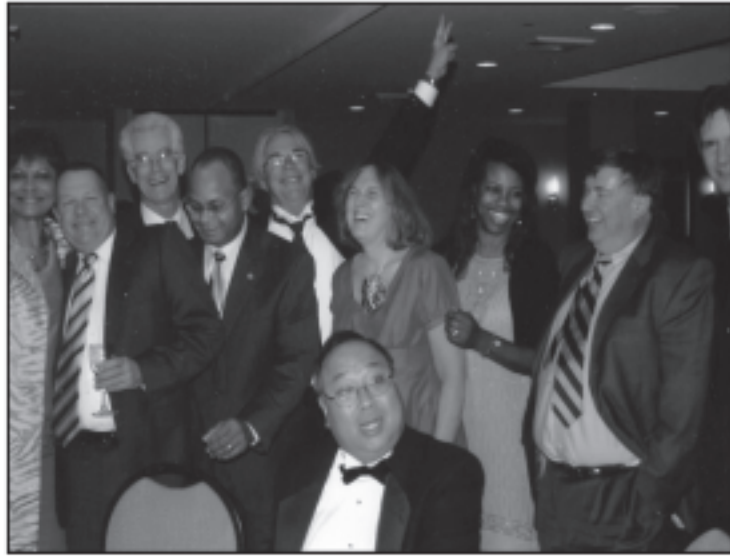
Class of 1979 whoops it up!