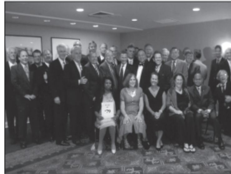
The Class of 1979 celebrates their 30th reunion.