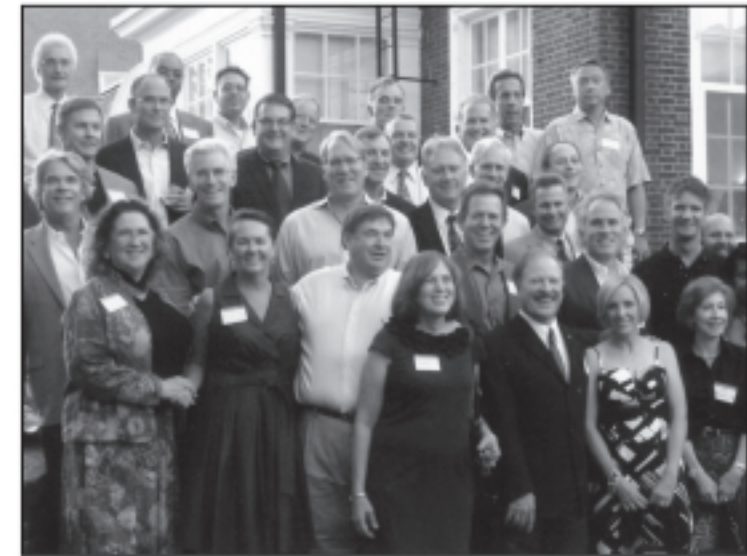
Class of 1979 at their 30th reunion.