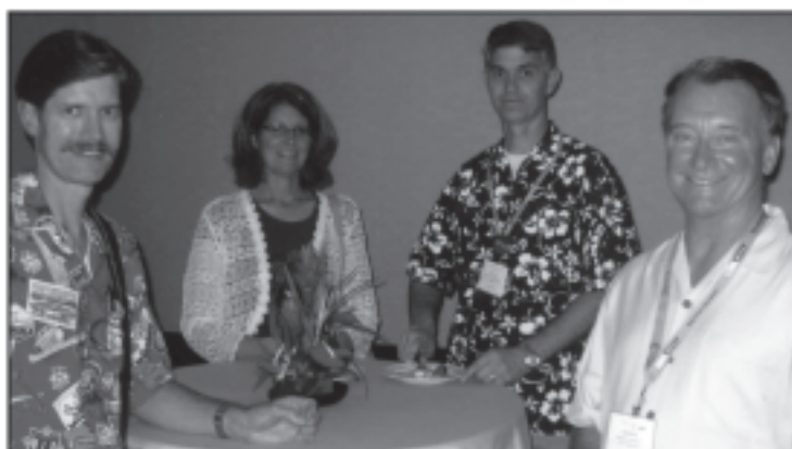
Guests enjoy the WUDAA reception at the ADA meeting.