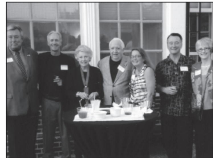
Guests enjoy the patio of the Alumni House.