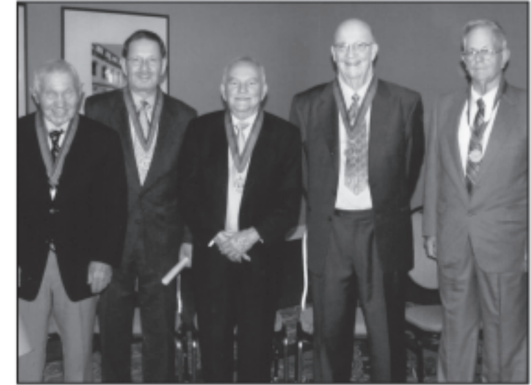
The Class of 1959 celebrates their 50th reunion.