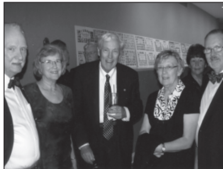
Guests mingle prior to the Banquet.