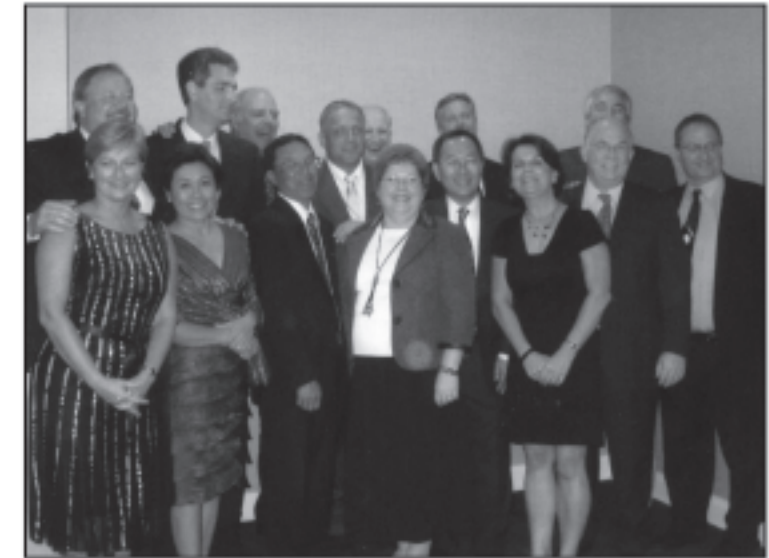
The Class of 1984 celebrates their 25th reunion.