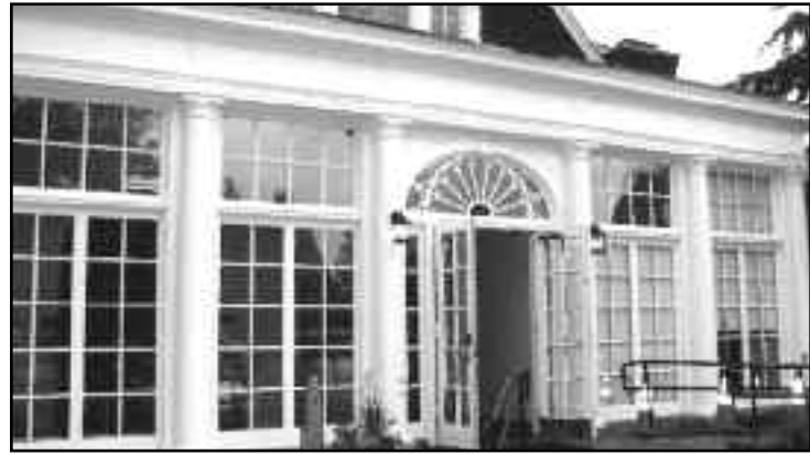
The Alumni House on Main Campus.