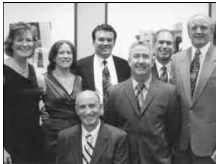
The Class of 1988 celebrates their 20th reunion.