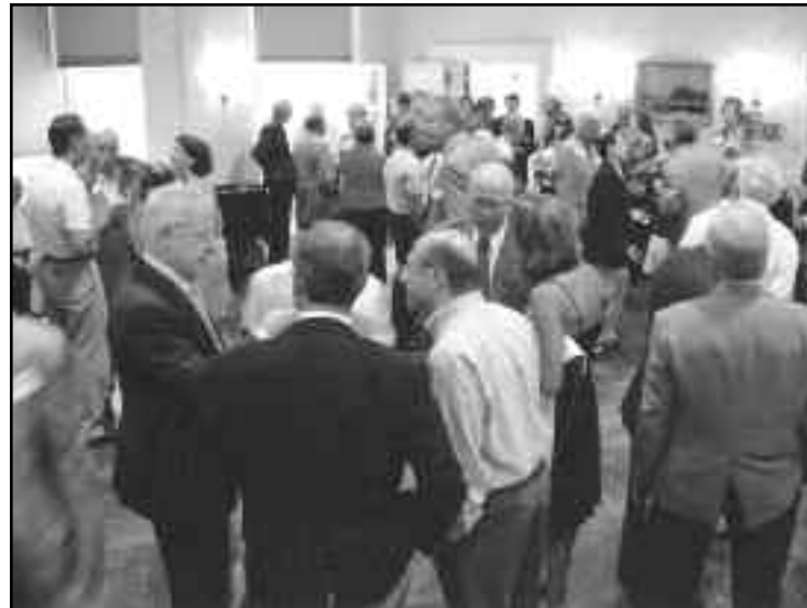
Catching up at the Alumni House.