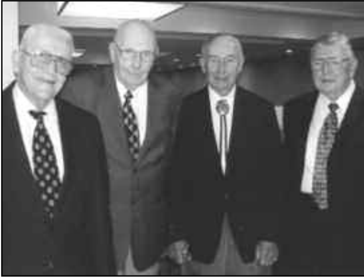
The Class of 1948 celebrates their 60th reunion.