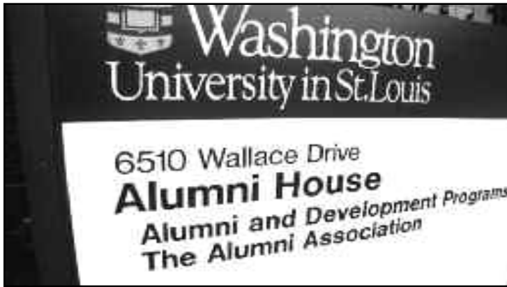
The Alumni House on Main Campus.