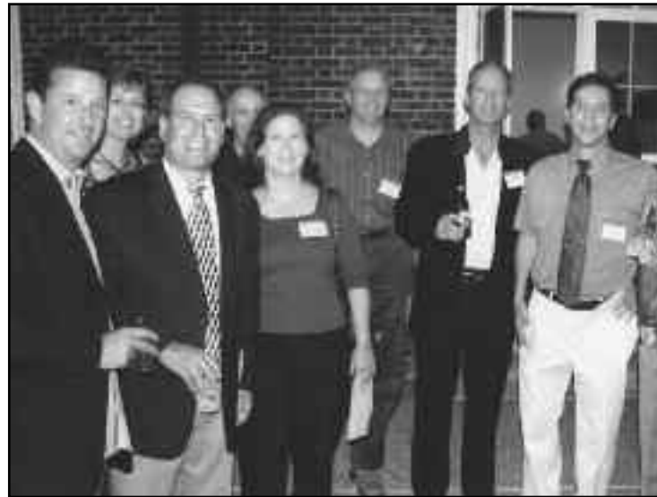
Member of the Class of 1988.