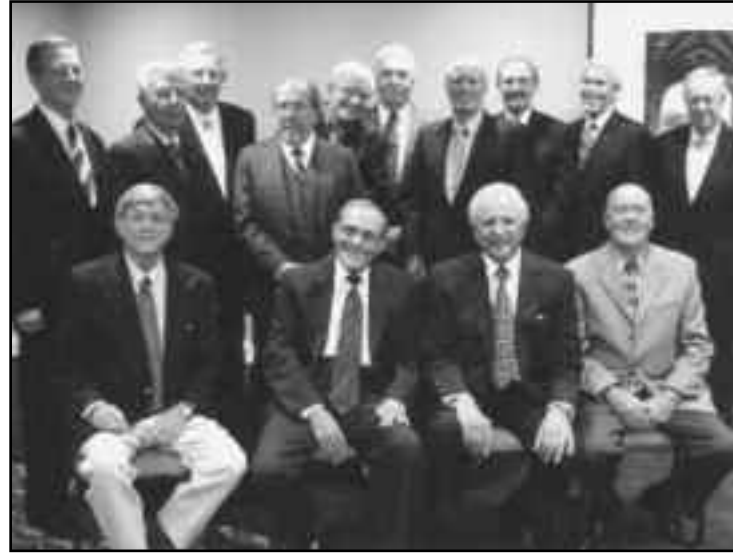
The Class of 1958 celebrates their 50th reunion.