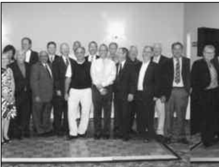
The Class of 1983 celebrates their 25th reunion.