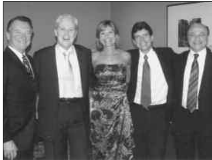
The Class of 1978 celebrates their 30th reunion.