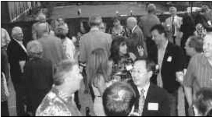
Guests on the patio at the Alumni House.