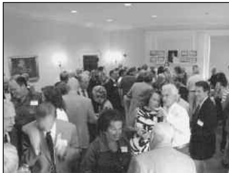
Alumni mingle at the reception.