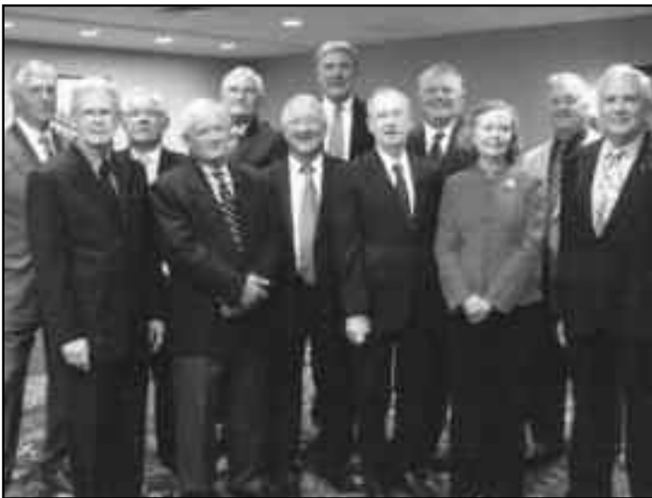
The Class of 1968 celebrates their 40th reunion.